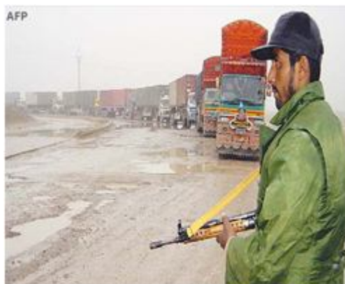
CHAMAN: A paramilitary soldier stands guard as flour-laden trucks are stopped at the border checkpoint of Chaman as part of government's move to stop smuggling of wheat and flour to Afghanistan.

QUETTA, Jan 15: Afghanistan closed its border with Pakistan on Tuesday, stopping all kind of traffic and movement of people.