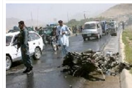
KABUL, August 30: Suicide attack on foreign troops' convoy in Paghman district of Kabul city left only the bomber dead.