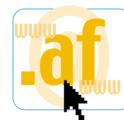
Afghanistan recovered its Internet domain www.af in 2003.

The great strides taken toward creating a democratic society accelerated with a UNDP-supported drive to register Afghans to vote in national elections. This $99 million drive