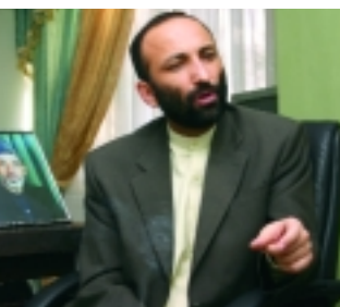
Haneef Atmar, Afghanistan's Minister of Rural Rehabilitation and Development.

registered 10.5 million Afghans, and despite the looming threat of insecurity, eight million of them voted in the October 2004 presidential elections.