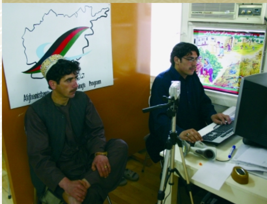
Counselors guide ex-combatants through disarmament, step by step.