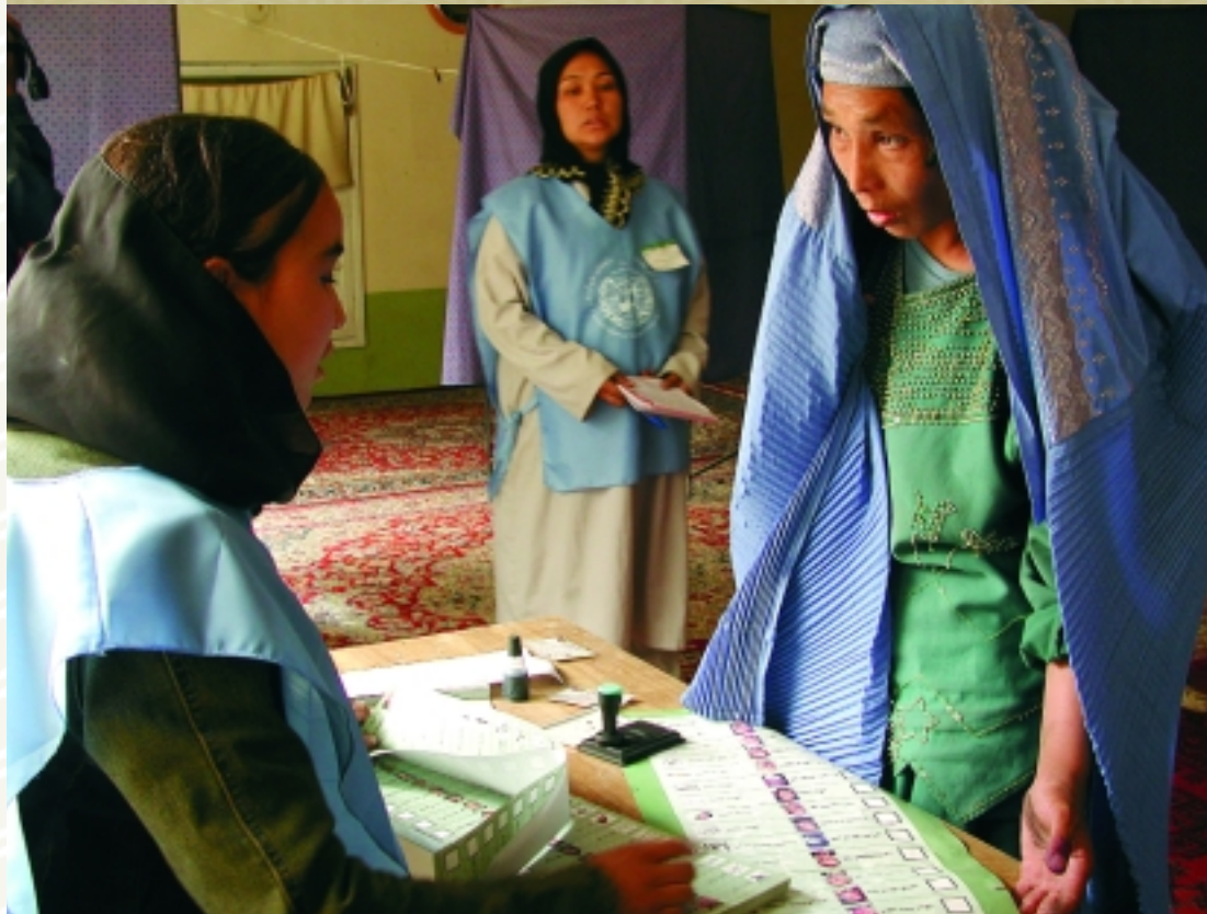
Braving harsh weather and uncertain security, women voters cast their ballots for president.