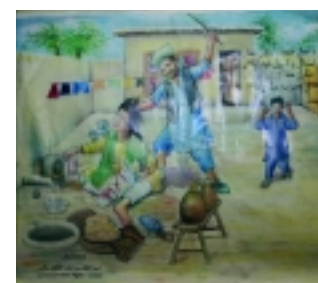
A campaign takes up violence against women.