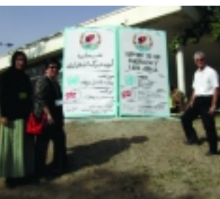
Afghanistan's historic Loya Jirga came about in June 2002.

In December 2001, the Bonn Agreement formed an Afghan Interim Authority and devised a roadmap for creating an internationally recognized government. As the path to democracy and rule of law became visible, it was apparent that the Afghan government needed support to begin implementing its obligations under the Bonn process. UNDP stepped in to bolster the Afghan government meet its new duties by helping to establish a Constitution Commission, a Human Rights Commission, and a committee charged with convening a traditional Loya Jirga .