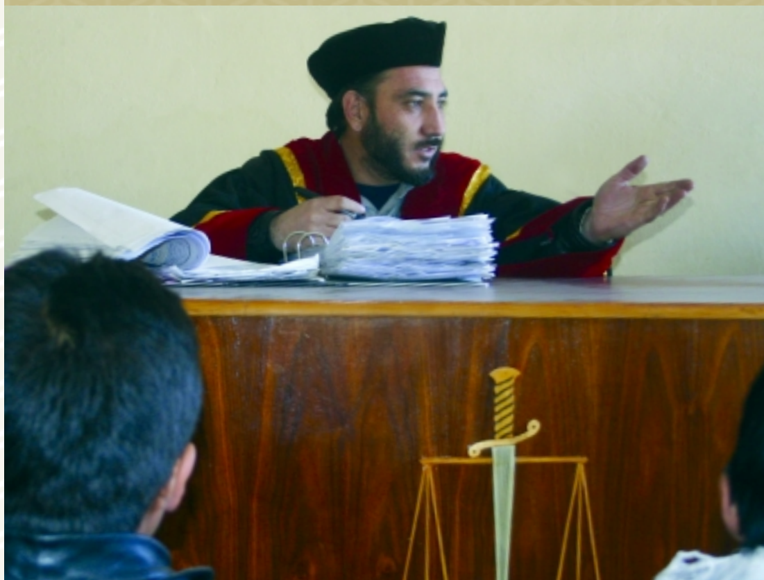
Judges reviving the practice of law, from courtrooms to codes.