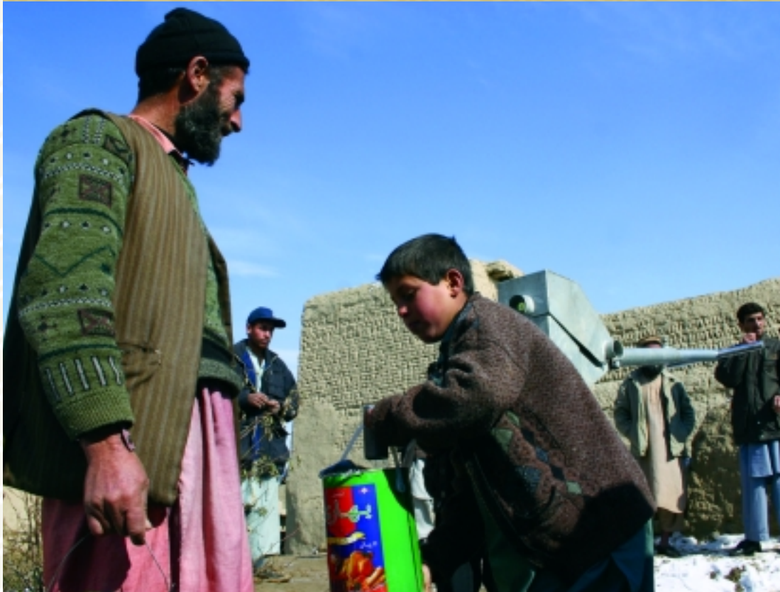
Access to clean drinking water saves countless lives across the country.