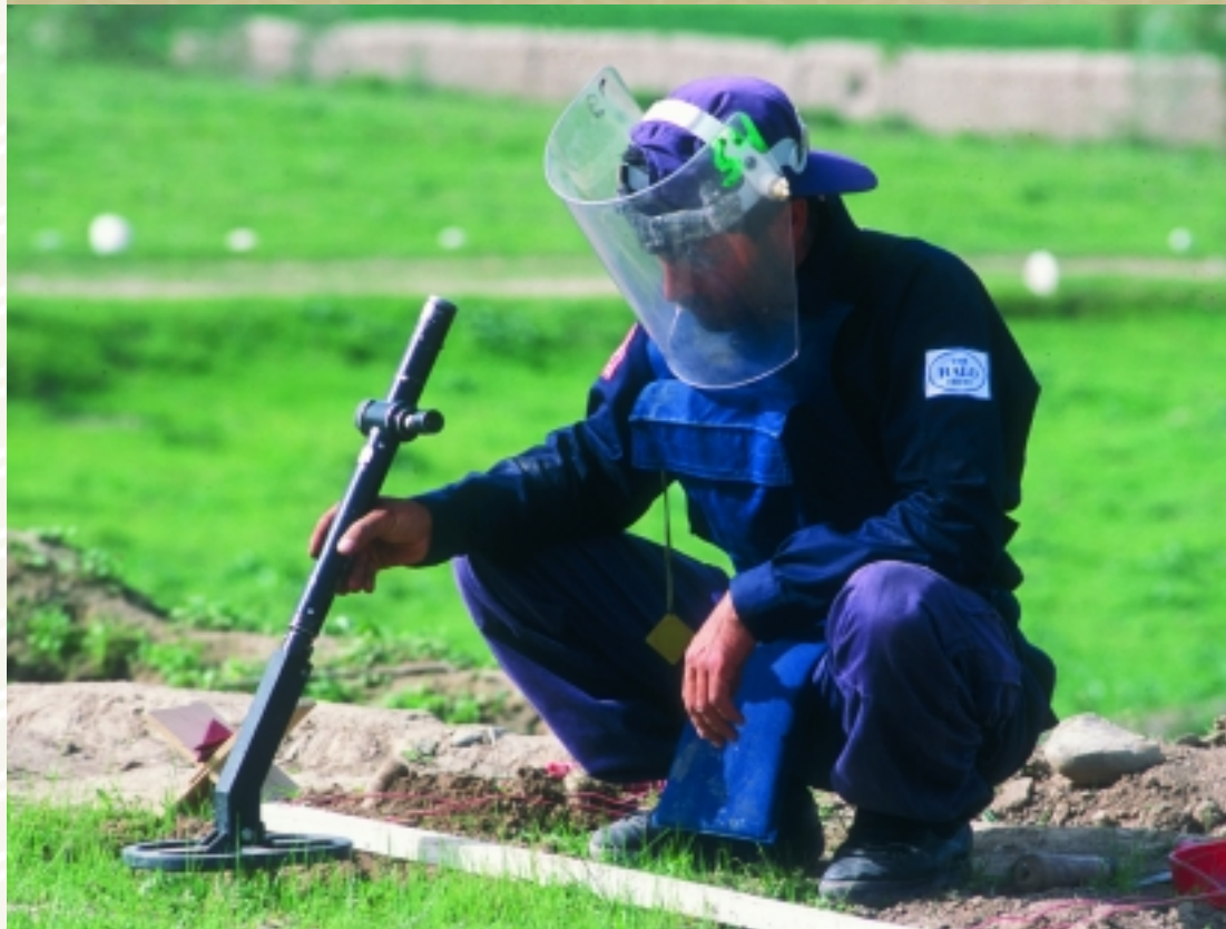
Deminers risk their lives each day, removing war's remnants from the ground.

— Haneef Atmar, Minister of Rural Rehabilitation and Development