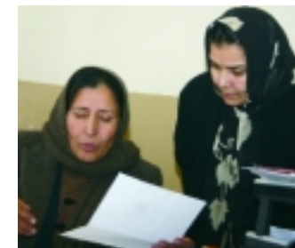
Staff at the Ministry of Women's Affairs chart policy.